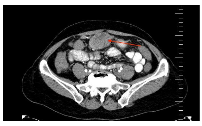
Figure 1 B: Sagittal Computed tomography image of the mass (Red arrow).