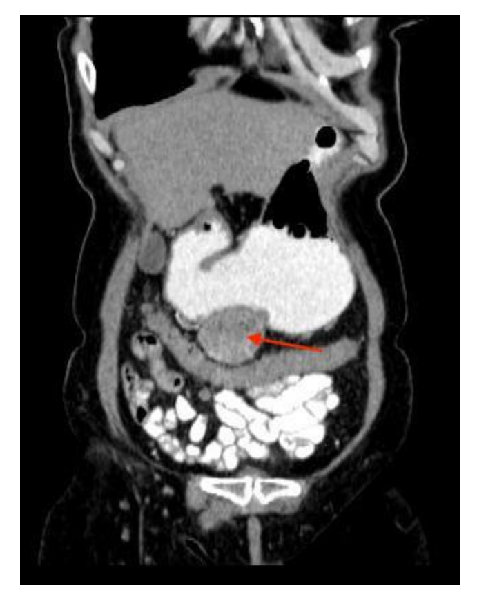
Figure 1 A: Coronal CT image of the mass (Red arrow).

gastrointestinal stromal tumor (GIST) of the stomach. One month later subtotal gastrectomy and omentectomy was performed as the histopathological examination of the previous specimen revealed positive surgical margin and the final report of the immunohistochemical examination was reported as LGESS with a 1.4cm diameter of and 18 reactive lymphadenopathy in total. Lymphovascular invasion of the tumor was detected. Yet, no perineural seen. invasion was Immunohistochemical examinaiton of the tumor revealed estrogen receptor positivity (ER+), progesterone receptor positivity (PR+), Bcl-2 positivity. Patient was discharged without any problem on the 5th postoperative day. She was prescribed Megestrol acetate 160 mg (once a day). During 6 month-follow-up no sign of recurrence or metastasis was detected.